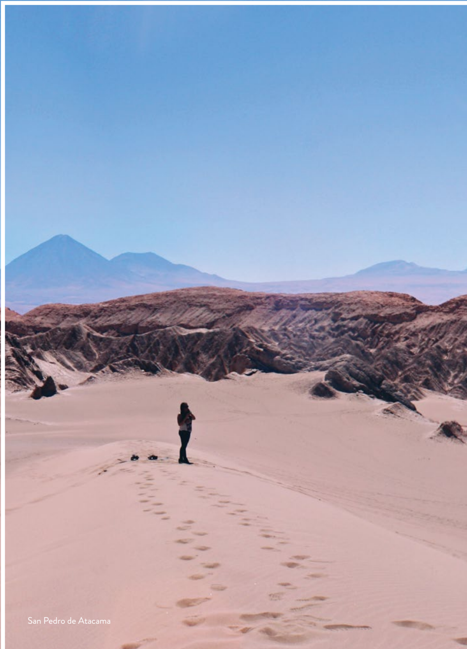
San Pedro de Atacama